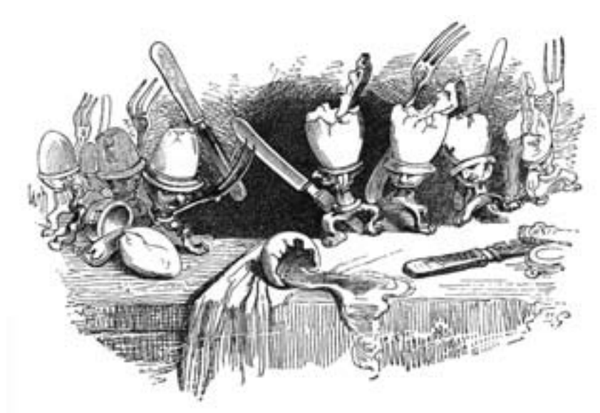
Carnage at the breakfast table is the outcome of the war between the Little-Endians and the Big-Endians. (The engraving, from the 1838 edition of Gulliver's Travels, is by J. J. Grandville.)

An International Lisp Conference was held at Stanford a year ago. This was a gathering of the faithful, and naturally there was talk about how to bring enlightenment to the rest of the world. It was also an occasion showing that even advocates of the same language are